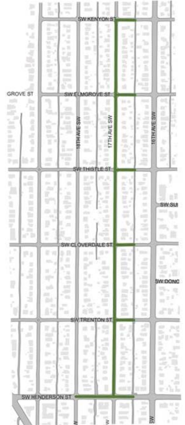
Project Area Map

Seattle's drainage and sewer system is a blend of combined, partially separated, and separated systems. Delridge is a neighborhood with a combined sewer system where the sewage and stormwater normally flow in one pipeline. When it rains, the volume of stormwater may exceed the capacity of the system, sometimes leading to sewage overflows to Longfellow Creek. These overflows not only spill sewage into our waterways, they also spill polluted stormwater runoff that flows off rooftops, streets, and other hard surfaces. The natural drainage system process slows and filters polluted runoff every time it rains. Natural drainage systems can slow or reduce polluted runoff by capturing it and cleaning it before it harms our waterways.