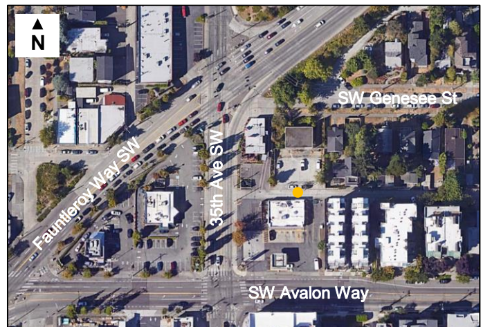
● Approximate boring location

The West Seattle and Ballard Link Extensions project is part of the voter-approved Sound Transit 3 Plan (ST3) to expand the regional mass transit system. When complete in 2030 (West Seattle) and 2035 (Ballard), these extensions will provide fast, reliable light rail connections to dense residential and job centers throughout the region.