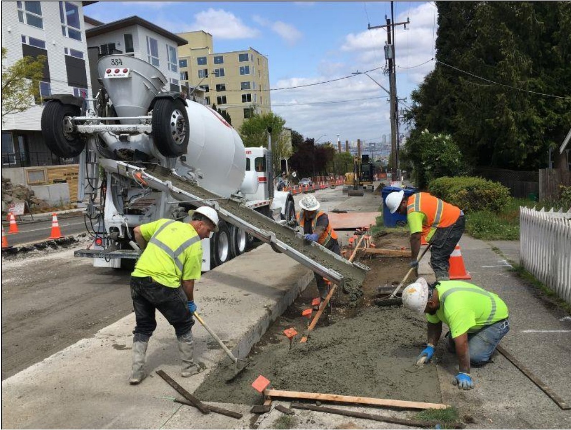
Example of concrete paving from SW Seattle Paving: 35th/ Avalon Project on SW Avalon Way