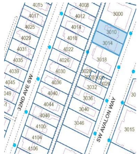
The top of this image is north. This map is for illustrative purposes only. In the event of omissions, errors or differences, the documents in Seattle DCI's files will control.

MORE INFORMATION: For more information regarding this application or the Design Review process, please visit the Design Review Program website at Design Review contact the Land Use Planner listed above, or email the Public Resource Center at PRC@seattle.gov